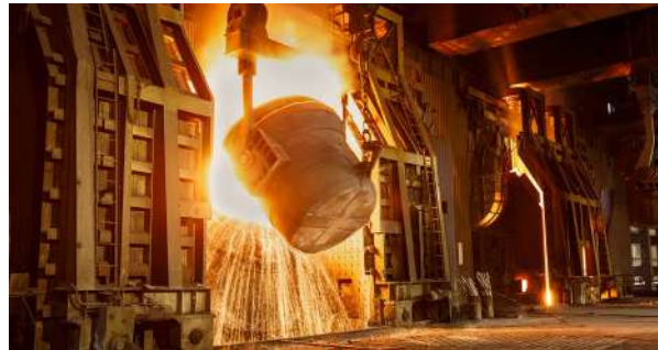
Steel & Iron Industries